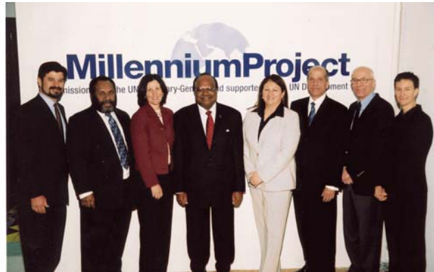
Launch U.N. MP - MDG 7 TF Report