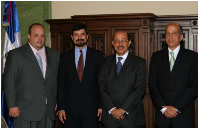
International Technical Cooperation Agreement (June 2006)