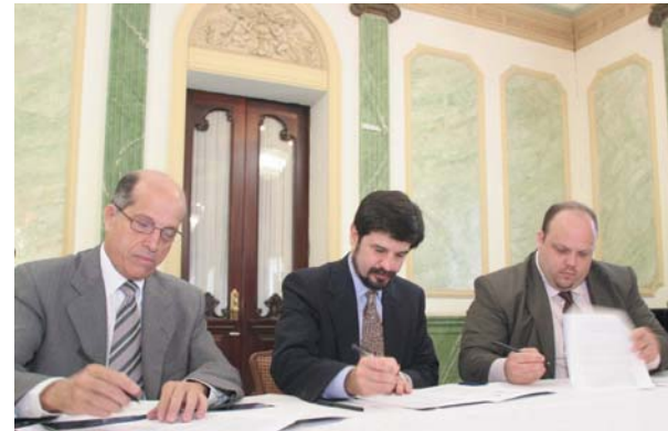
Cooperation Agreement (Jan. 2006)