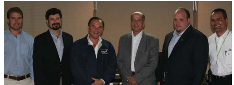
Private Sector Meeting (Dec. 2006)